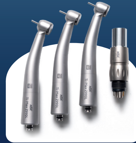
NSK's Ti-Max Z990L High-Speed Air-Driven Handpiece Bundle Shown.